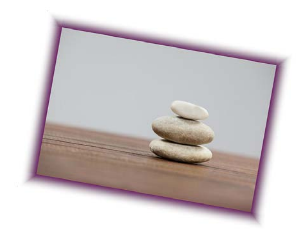
Anyone can be a Dementia Friend!

Dementia Friends help people living with dementia by taking actions - both big and small. These actions don't have to be time-consuming. From visiting someone you know with dementia to being more patient in a shop queue, every action counts! Dementia Friends can also get involved with things like volunteering, campaigning, or wearing a badge to raise awareness.