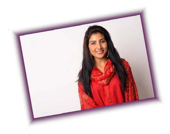
Supporting women and girls

They work with women and girls of all ages, including lesbian women, bisexual women and trans women and offer services in Kurdish, Farsi, Arabic, Dari, Pashto, Turkish and English.