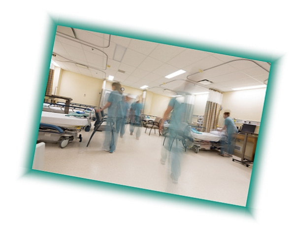
Those in poorer areas generally wait longer

We found nearly half of the respondents (46%) said they or their relatives didn't receive enough information, or any at all, about when they can expect their treatment. Similarly, 48% didn't receive any support to manage their condition during their wait, while 64% had not been given a contact they could turn to while waiting for treatment."