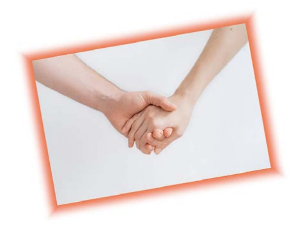
Providing the 'best possible care'

By community-based specialist palliative care, we are referring to settings where a specialist level of palliative care is delivered that is not within a hospital or from a GP surgery. Examples include hospice beds, community specialist palliative care nursing team, hospice day and outpatient services, hospice@home (in patient's own home).