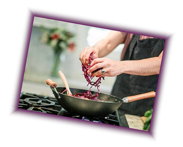
Drop in for a well cooked and presented meal

Their meals on Saturdays are a chance for people to meet and socialise with people in their local community and have a fun evening.