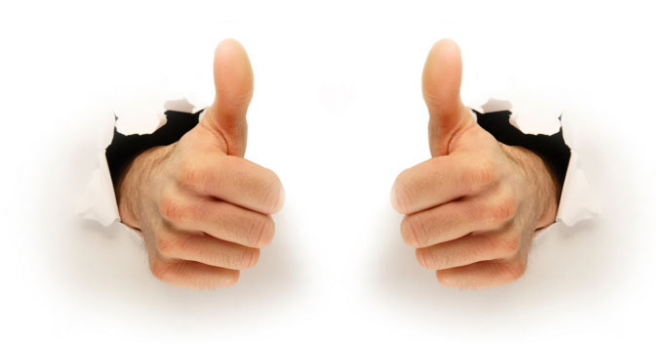
Advice and tips from the Alzheimer's Society

You will learn more about dementia and the treatments, support and services that are available. You'll find information about how you can live as well as possible with dementia and about making plans for the future.