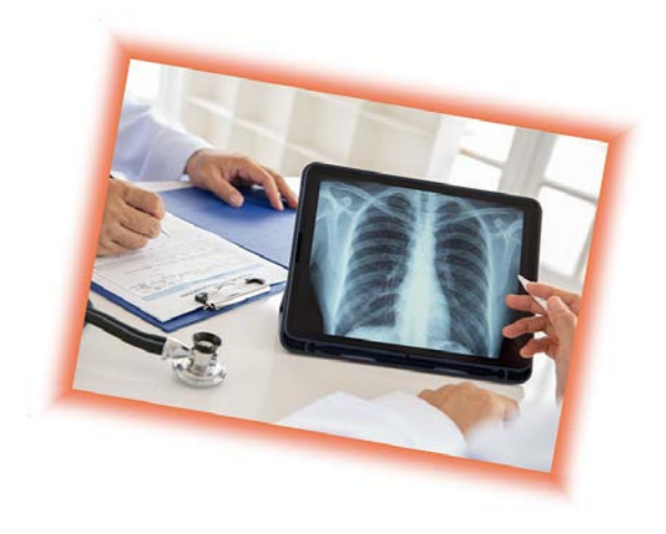
Is it time to get a lung health check?

The checks are conducted remotely via the telephone and scans are taking place at the Royal Brompton Hospital and at mobile scanner sites.