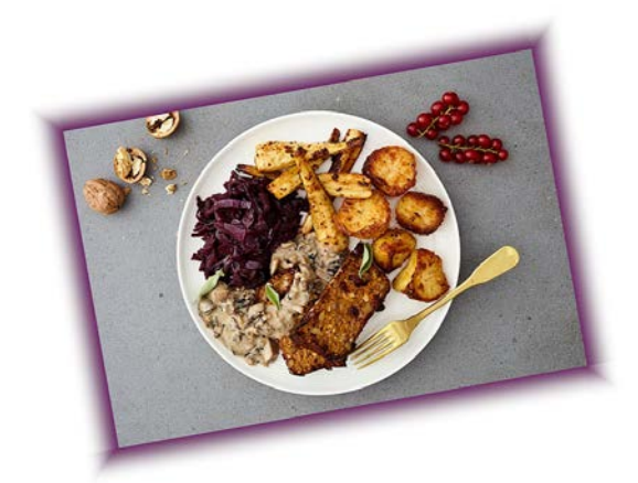
700 meals will be delivered to those in need

Due to Covid-19 it won't be possible to hold the Big Christmas Day Lunch event at an indoor venue this year. But H&F Council is partnering with local charity UNITED in Hammersmith & Fulham (unitedhf.org) to deliver a Festive Meal and a gift bag to 700 lonely or isolated people.