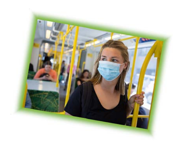
Wear a mask in shops and on public transport

With the new Omicron variant, new restrictions have been put in place. Face coverings must be worn in shops and on public transport.