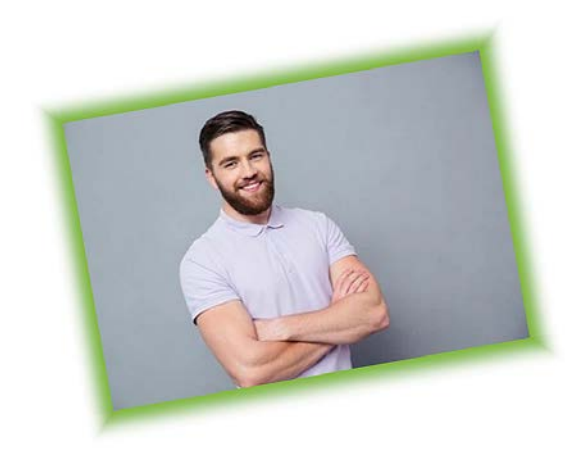
The vaccines will boost your immunity

Viruses spread more easily during the winter when people spend more time together indoors. Both flu and Covid-19 can be life threatening, but you can protect yourself and your loved ones by getting a flu jab, a Covid-19 vaccination and/or a booster if offered.